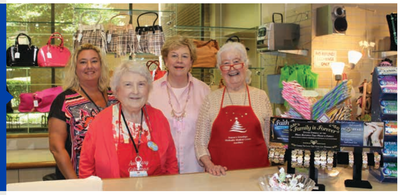
Methodist Dallas Auxiliary members volunteer in the Gift Shop, donating all proceeds back to hospital programs.

Meet the volunteer organizations dedicated to Methodist